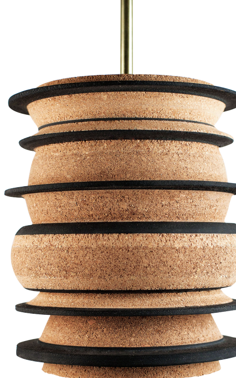
Samsara Cosmic Series