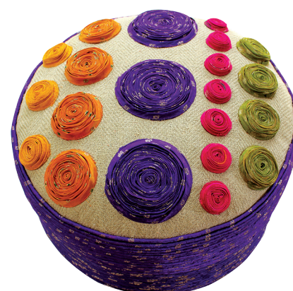
Bindi dot seating collection