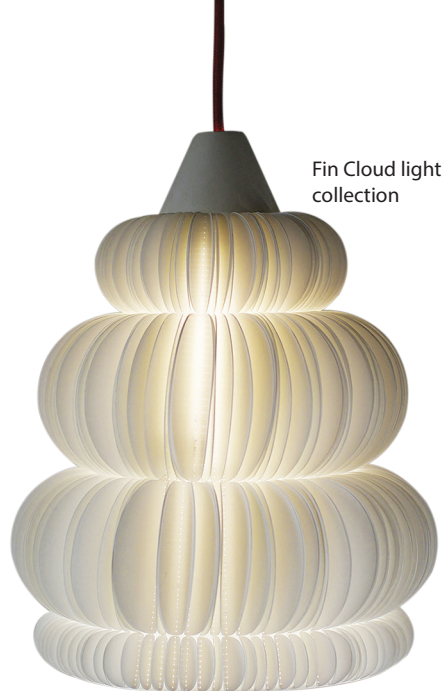
Fin Cloud light collection