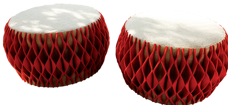
Marigold seating collection

The need of the hour is designing smart objects in sustainable ways – products that harness fully ones cultural references, artisanal heritage and weave it together into a high quality product, considering the impact of the same products on the environment vis-a-vis their shelf life and longevity. For me that is innovation.