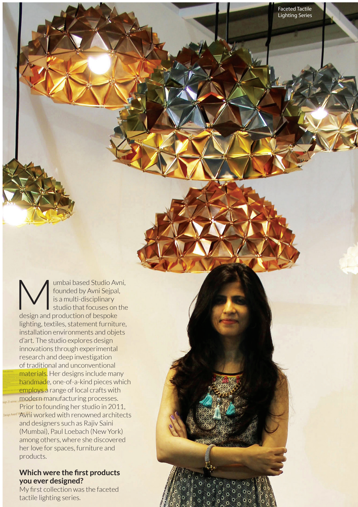
Faceted Tactile Lighting Series